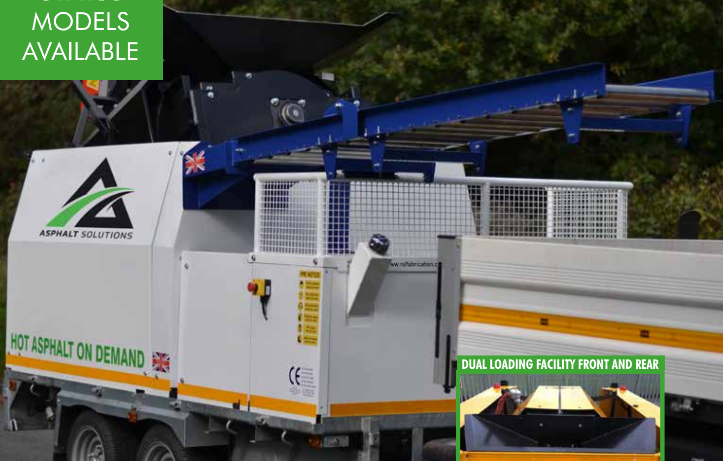
DUAL LOADING FACILITY FRONT AND REAR